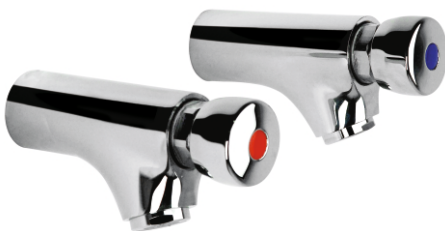
non concussive wall mounted tap (pairs) NC170CP